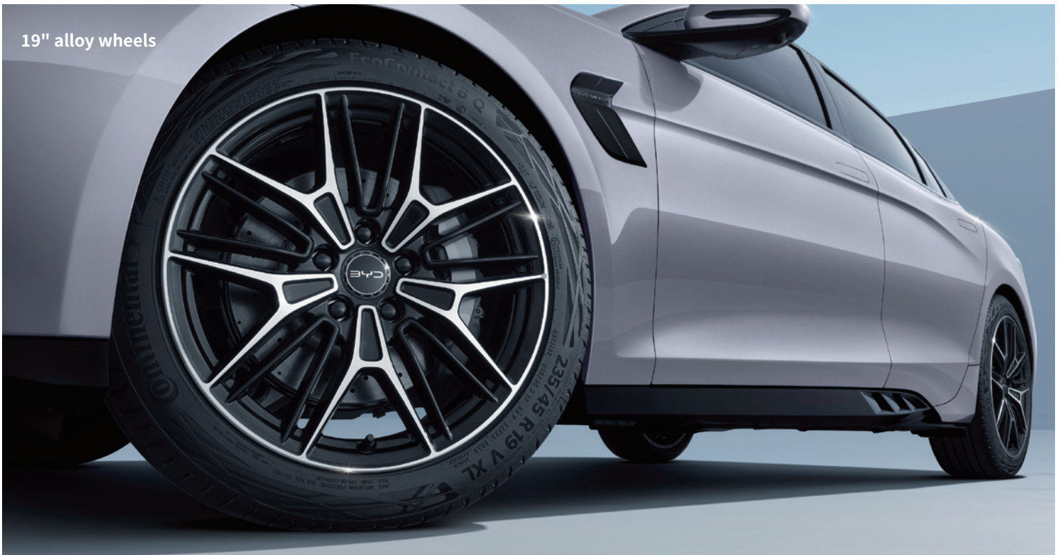
19" alloy wheels